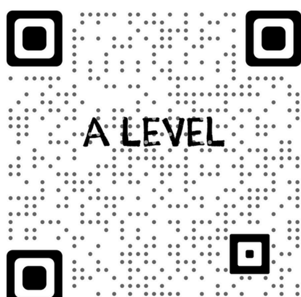
ACCESS ALEVEL SCRIPTS