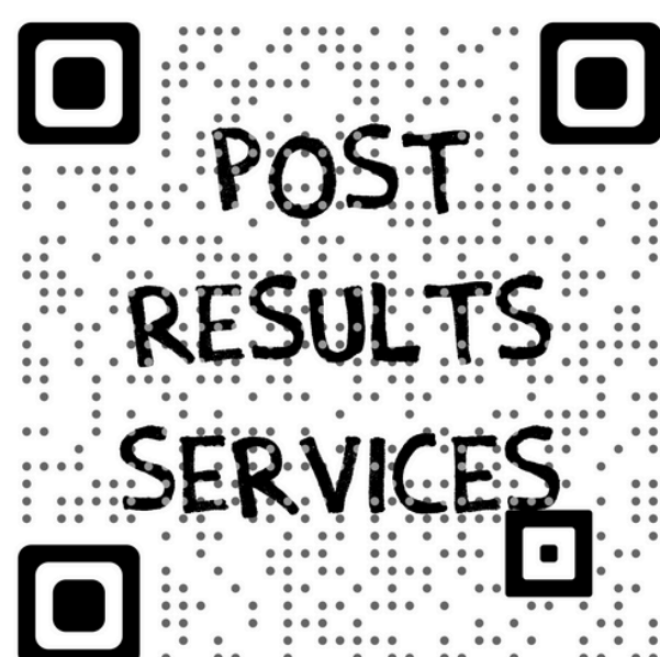
POST RESULTS SERVICES