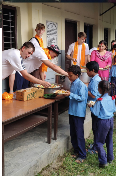
Pupils in Nepal are enjoying meals at their primary school for the first time thanks to a group of students and staff from Bilborough College.